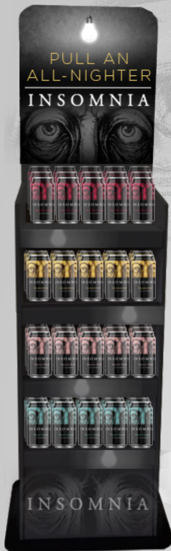
Standing can rack

Stabilize and grow Insomnia to a top ten premium selling wine brand with focus on national chain distribution and cans.