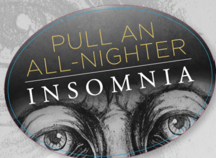
Cold box cling